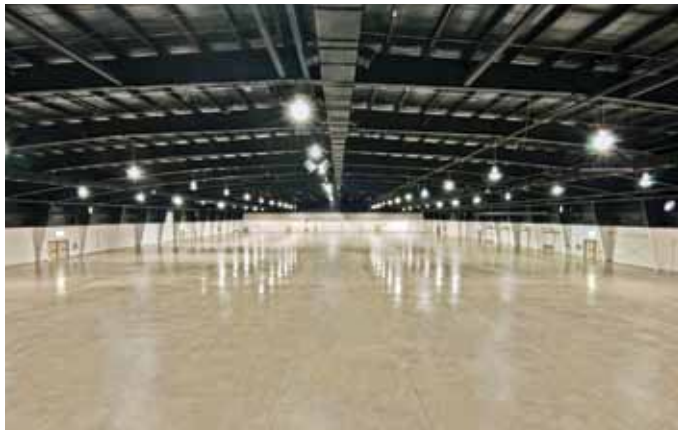
HALL 5 / ARROW HALL